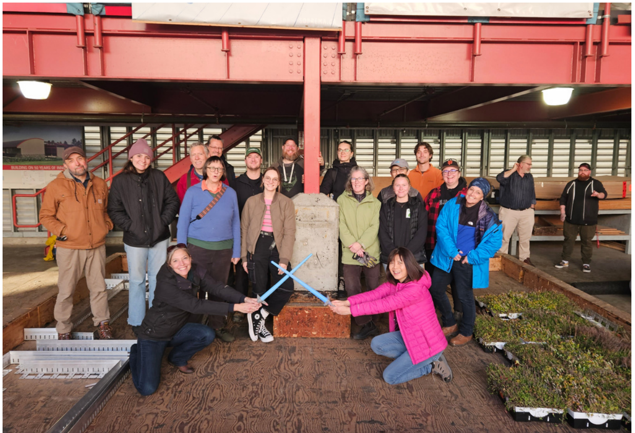
A successful GRIMP class finishing training in Vancouver, November 2023.

In 2023, GRHC conducted four successful hands on training courses across North America in partnership with Ginkgo Sustainability, Recover Green Roofs, New York Green Roofs and RCABC. We trained over 50 people in green roof installation and maintenance principles. Join GRHC in 2024 in Toronto and other locations and become a GRIMP. The GRIMP Training involves a combination of hands-on and presentation style training that introduces the basic skills and knowledge required to install green roofs and maintain them. This training covers a variety of green roof systems providing green roof installers and maintenance professionals with the information, techniques, and training necessary to successfully install and maintain basic extensive green roofs.