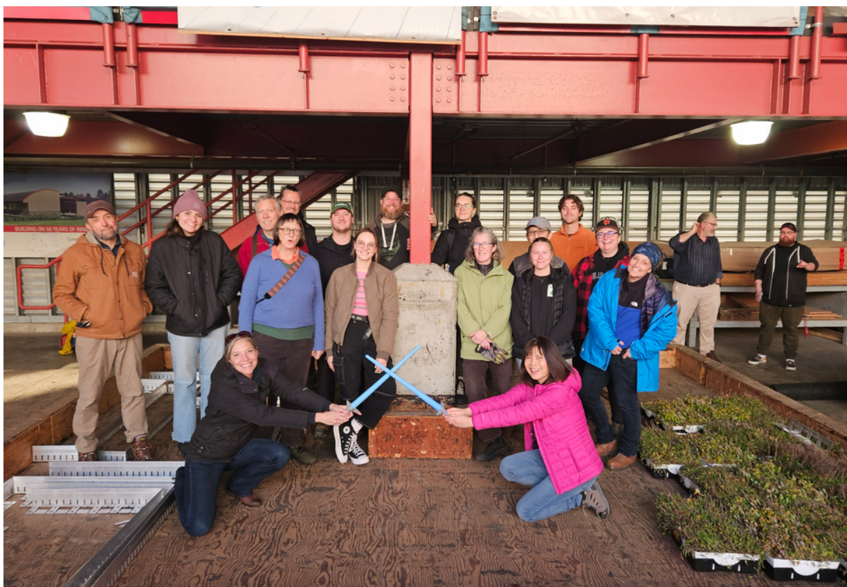
A successful GRIMP class finishing training in Vancouver, November 2023.

In 2023, GRHC conducted four successful hands on training courses across North America in partnership with Ginkgo Sustainability, Recover Green Roofs, New York Green Roofs and RCABC. We trained over 50 people in green roof installation and maintenance principles. Join GRHC in 2024 in Toronto and other locations and become a GRIMP. The GRIMP Training involves a combination of hands-on and presentation style training that introduces the basic skills and knowledge required to install green roofs and maintain them. This training covers a variety of green roof systems providing green roof installers and maintenance professionals with the information, techniques, and training necessary to successfully install and maintain basic extensive green roofs.